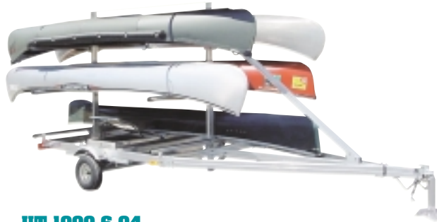
UT-1000-6-04 This all bolted aluminum trailer has a 1000 pound capacity and weighs 305 lbs. It is fully adjustable for carrying 6 canoes up to 18' in length. Standard adjustable crossbars with vinyl extrusions to protect your boats. (Shown with optional storage box)