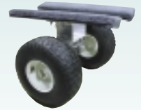
SUT-300GPD* Canoe / Kayak Dolly