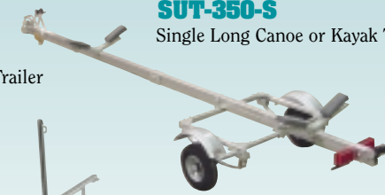
SUT-350-S Single Long Canoe or Kayak Trailer - up to 22'