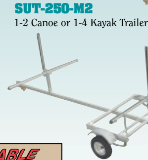
SUT-250-M2 1-2 Canoe or 1-4 Kayak Trailer