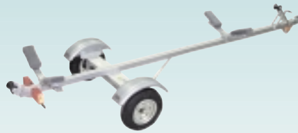
SUT-200-S Single Canoe or Kayak Trailer