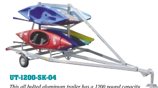
UT-1200-SK-04 This all bolted aluminum trailer has a 1200 pound capacity and weighs 390 lbs. It is designed to carry sea kayaks. Standard adjustable crossbars with vinyl extrusions to protect your boats. (60" between vertical posts). For boats up to 19' in length.