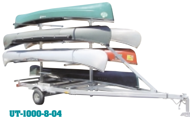
UT-1000-8-04 This all bolted aluminum trailer has a 1000 pound capacity and weighs 340 lbs. It is fully adjustable for carrying 8 canoes up to 18' in length. Standard adjustable crossbars with vinyl extrusions to protect your boats. (Shown with optional storage box)