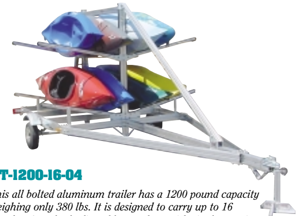
UT-1200-16-04 This all bolted aluminum trailer has a 1200 pound capacity weighing only 380 lbs. It is designed to carry up to 16 kayaks. Standard adjustable crossbars with vinyl extrusions to protect your boats. (32-1/8" between vertical posts). For boats up to 19' in length.